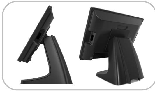
Small footprint and compact design