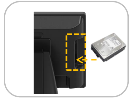
Easy access 2.5" HDD