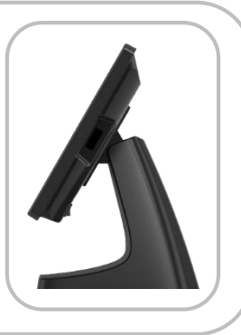
Optional VFD & 9.7" 2nd display, MSR, or iButton devices