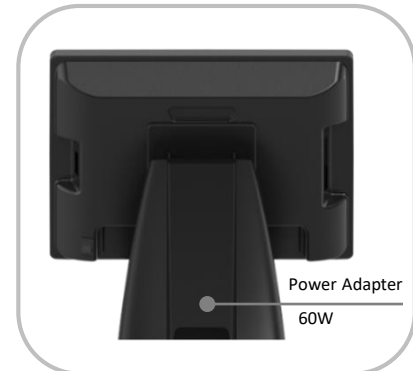
Power adapter embedded within base 60W