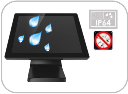
IP64 on front panel protection