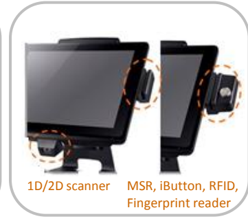
Various options of peripherals