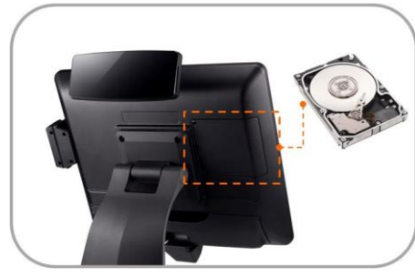
Easy access 2.5" HDD for installation and maintenance