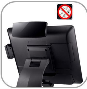
Vents-free & fanless design