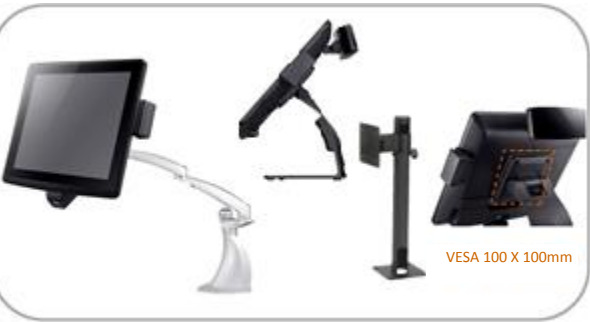
Support of industrial standard VESA mounting