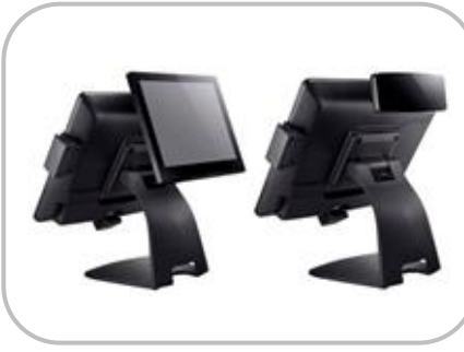
Optional VFD & 8"/10.4" customer display