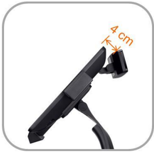
All-in-one panel PC type with ultra-slim design

High performance All-in-One POS Terminal –15" panel PC style with aluminum enclosure