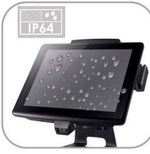
IP64 water & dust-proof front panel protection